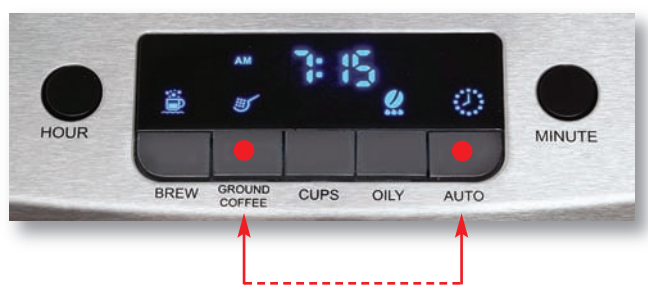
Simultaneously push and hold buttons for Grind & Clean Cycle

• Attempt to clear the clog by using the Grind & Clean Cycle. Push and hold the "Ground Coffee" button, and the "Auto" button at the same time. This will cut off the flow of the coffee beans and engage only the grinder. Any minor clogging caused by grounds will be expelled into the filter basket.